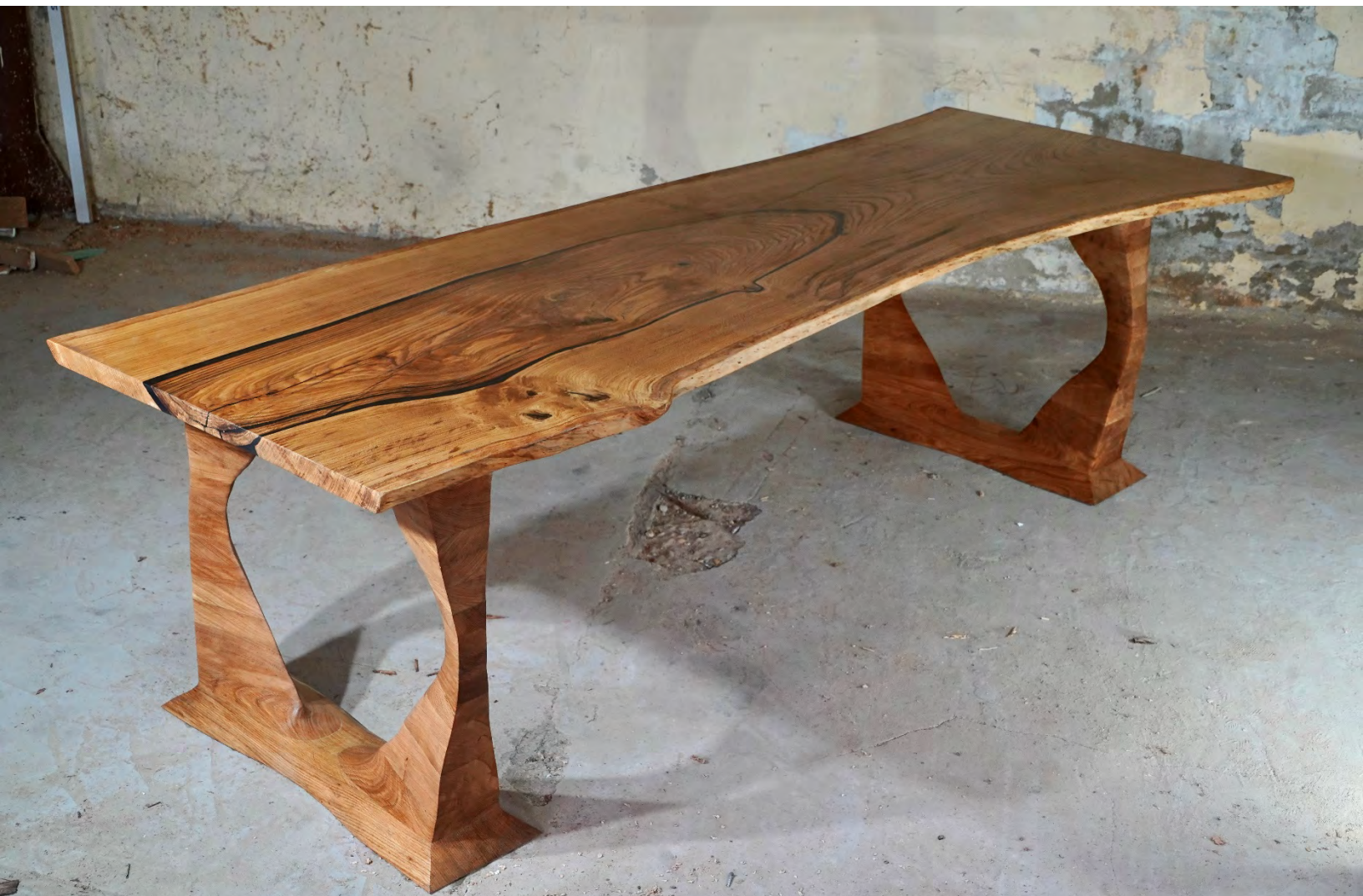
150-200 years old oak dining table, with black epoxy fill, with handmade oak feet (Platinum) 8 seater 100x270