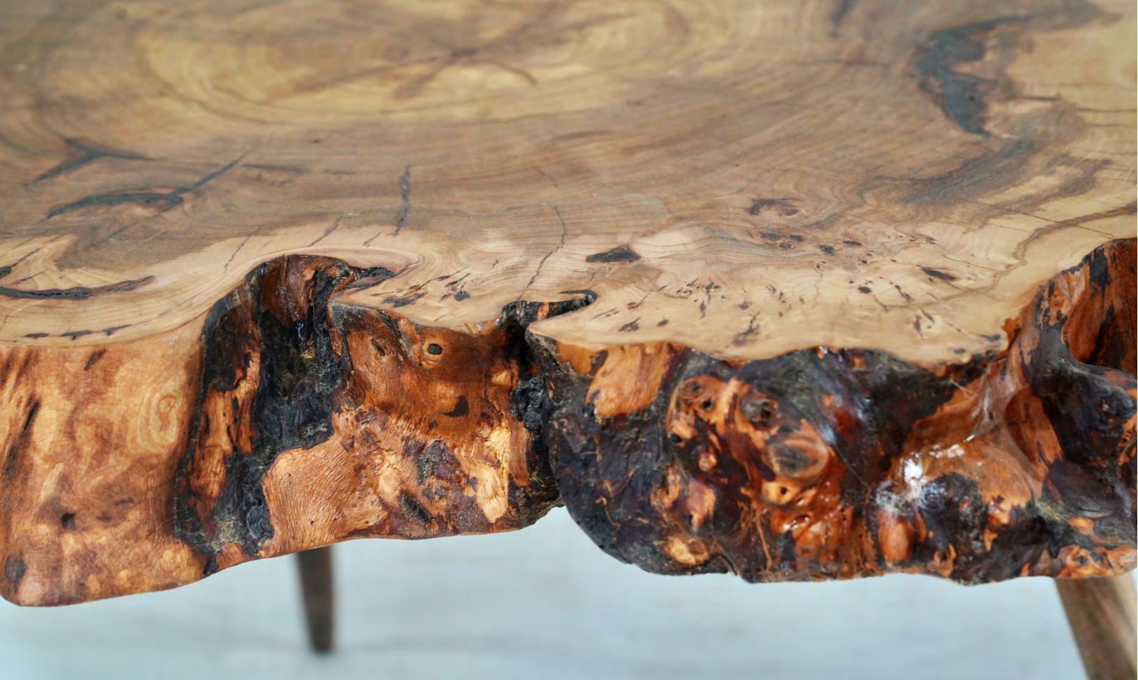
Burl elm – 70 cm, crystal clear epoxy fill in the middle, on turned walnut feet (High heels)