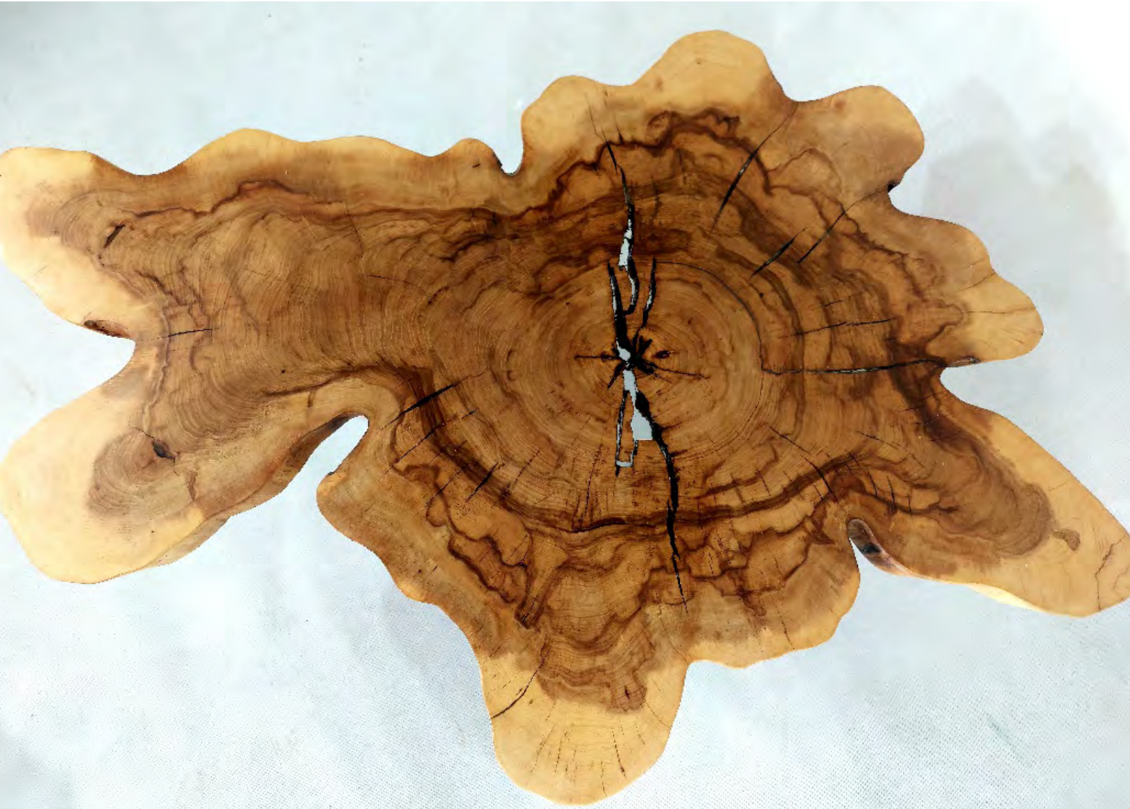
Chestnut 120 cm, crystal clear epoxy fill in the middle, on turned walnut feet (High heels)