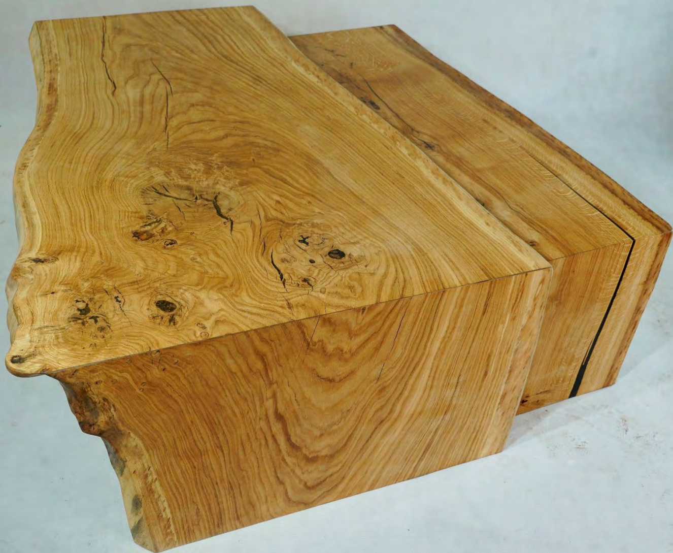
150-200 years old English oak trunk and frame, coffee table in various sizes individually or in a set (115x70x42) (105x60x38) below