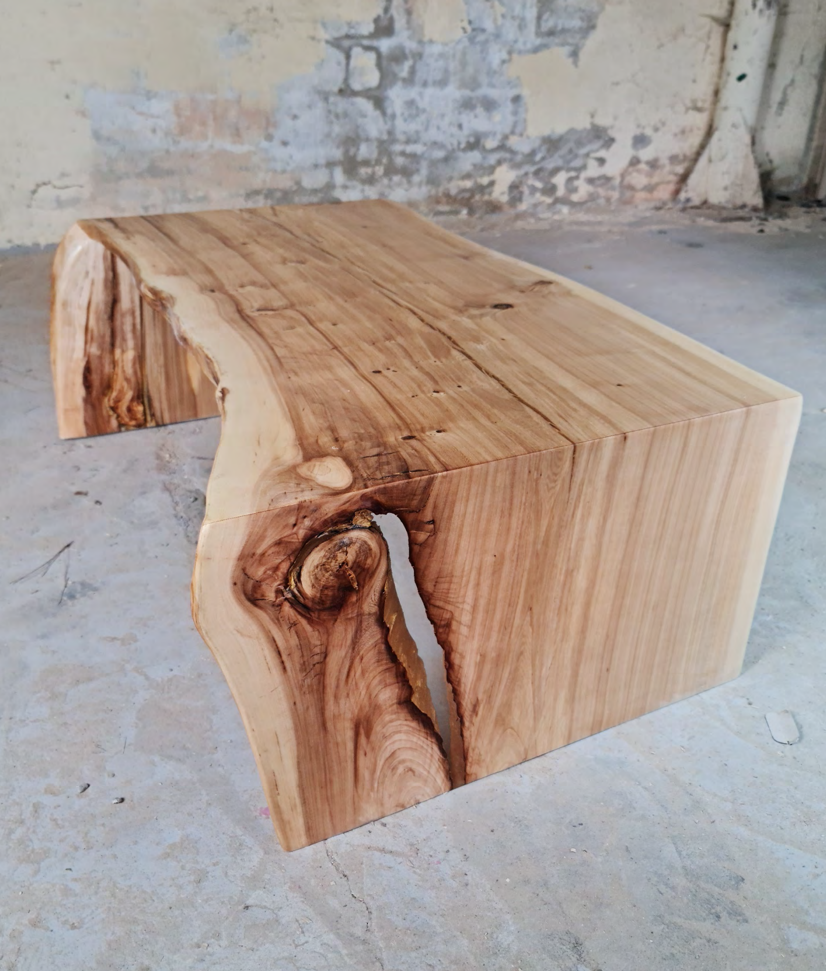
Elm, gold painted, filled with crystal clear epoxy (Goldie edition) 110x60x42