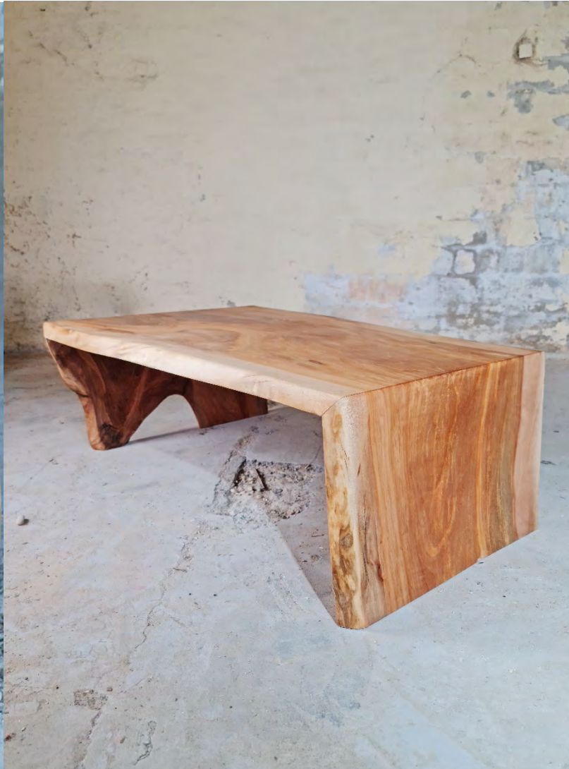
From a 200-250 y.o. Plane-tree branch 120x70x42