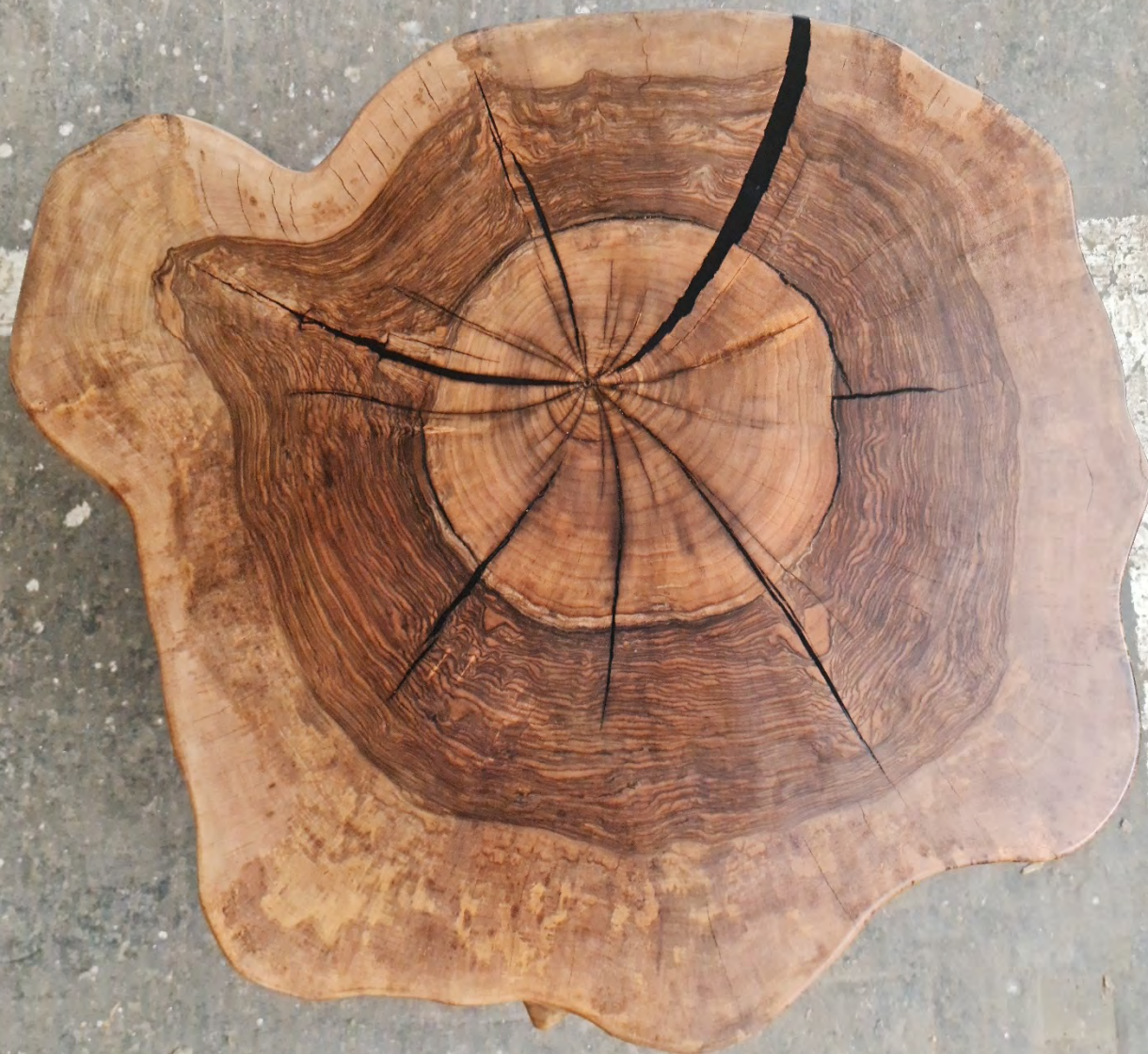
More than 150 years old walnut slice table- 110 cm, filled with black epoxy, with metal feet (Sting)