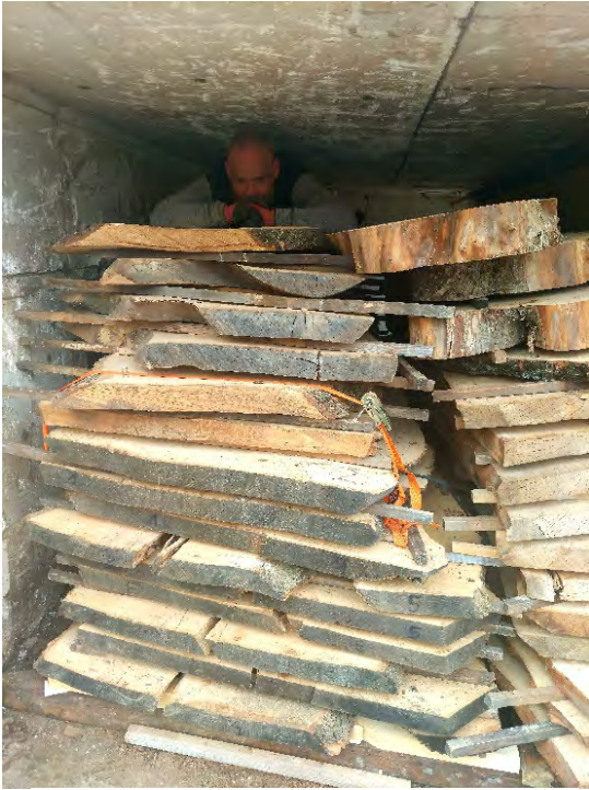
Stacking 4000. Out of the drying chamber and in with

After this, once the material has reached optimal moisture content level for the artificial drying process, the next stage is the drying chamber. The professional, slow, gentle drying process starts.