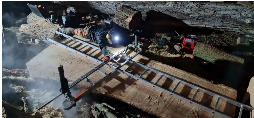
-9 degrees Celsius. Pitch-black. Adam doesn't stop. There is gas and a torchlight. Adventure.

Sometimes in the swamp, sometimes in the reed, on farmlands, forests, in the rain, or in the snow, in -10 degrees Celsius, or in +40 degrees Celsius.