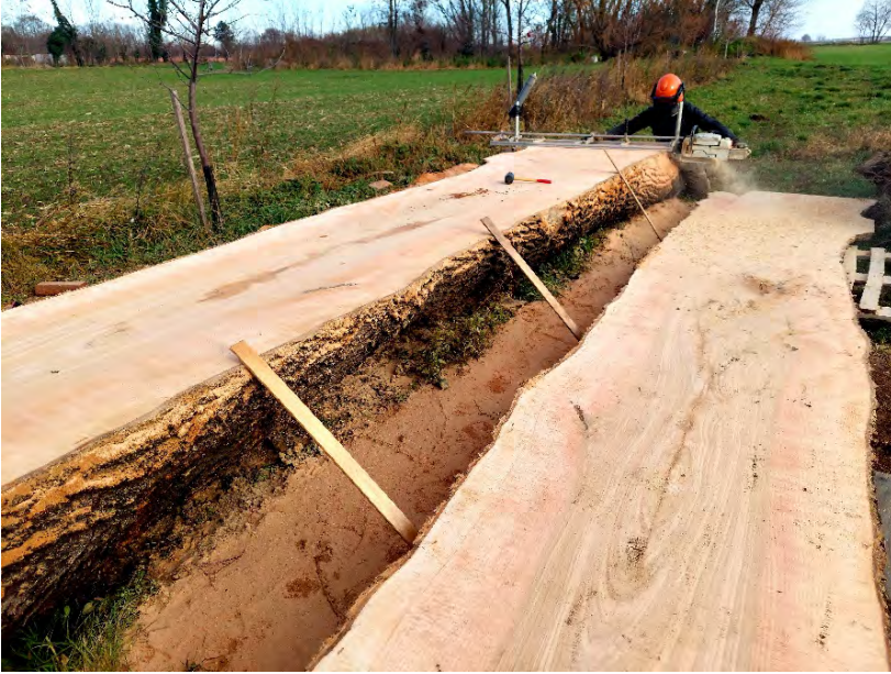
A true historical rarity. Ash wood 6,4 m length, 120 cm width

As we have already mentioned we chaperone each of our tables from start to finish. These logs you won't find at any timber lot or logger company due to their size and weight. In many cases out of lack of aesthetic sense or -according to us - as an assault on nature, these majestic giants are either left to perish or burnt as firewood. Due to their illness and/or age, they are usually not suitable for general carpentry work, so these rare logs are simply demolished.