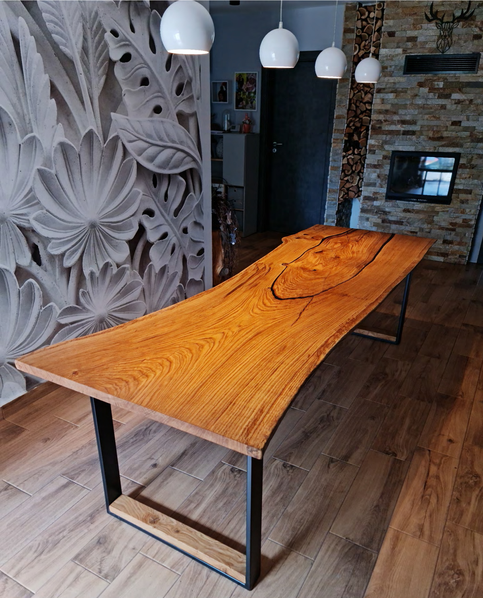
English oak dining table, 8 seater, with black epoxy fill, oak insert feet (Ultra) 100x265